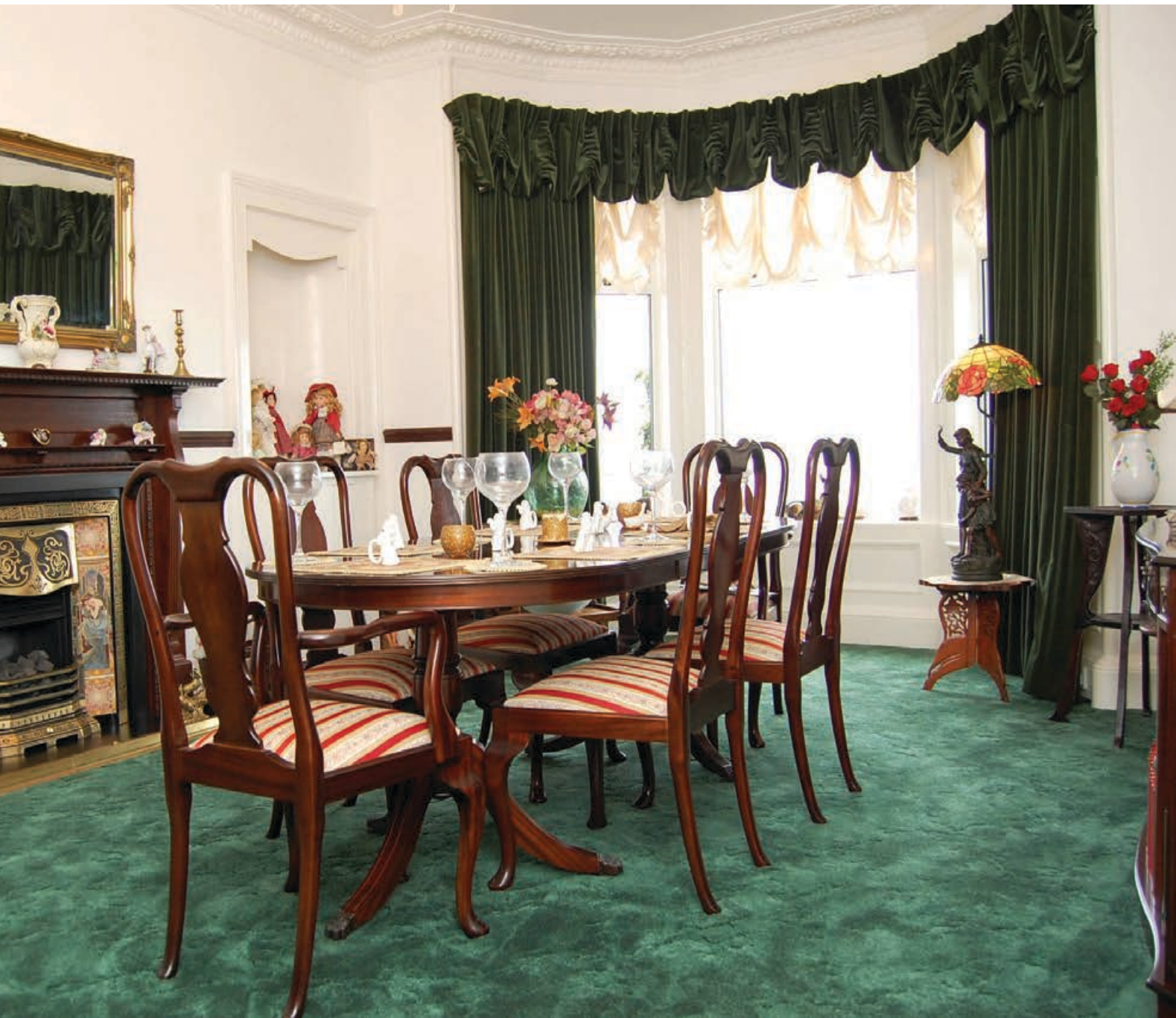
"Forth View" 55 Seaview Terrace, EDINBURGH EH15 2HE